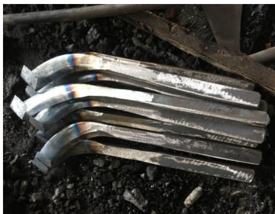
Figure 1 Tapping knife

This study aimed to analyze the effect of quenching with different cooling media on the hardness value of the JIS SUP 9 (0.52-0.6 Carbon composition) tapping knife (Figure 1), in order to get a knife that was not shaken and hard the patient testing. The study was conducted at the FT UNP Padang Metallurgy and Metrology Laboratory.