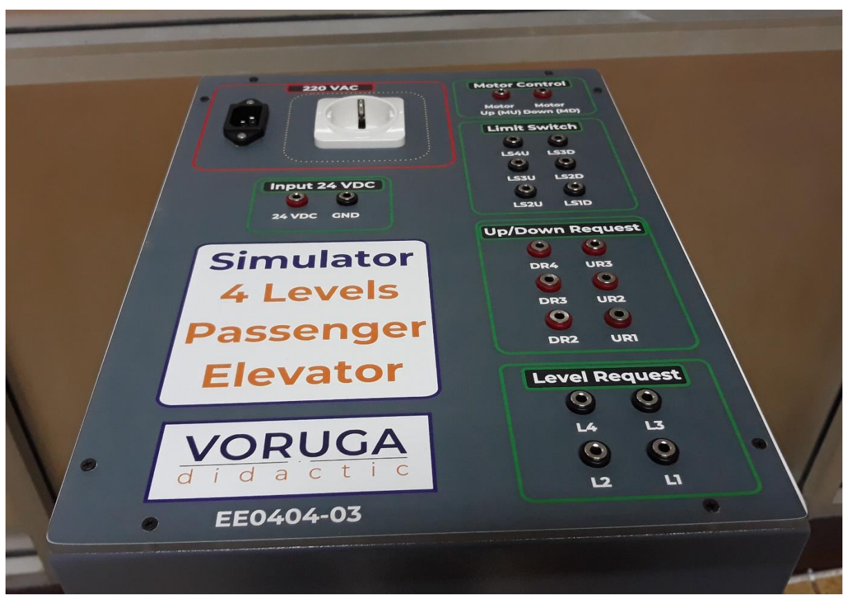
Figure. 3 Elevator Control Box Panel