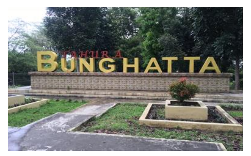
Figure 1. Bung Hatta Grand Forest Park